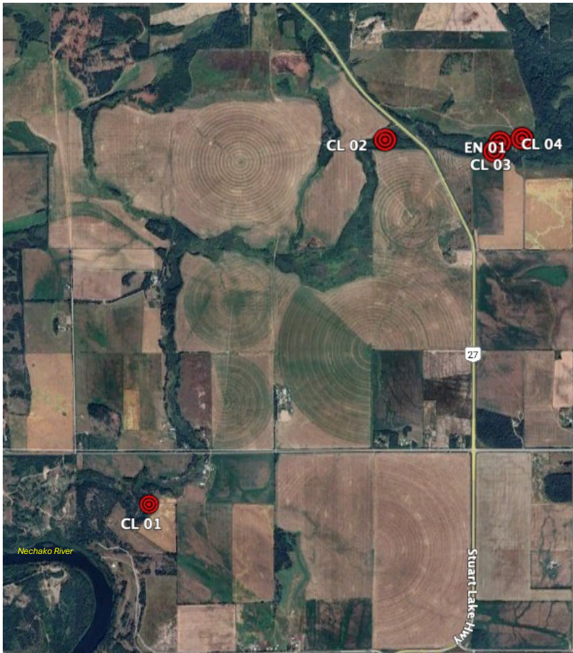
Figure 2. Locations of sampling sites on Clear Creek in relation to NEWSS restoration site.