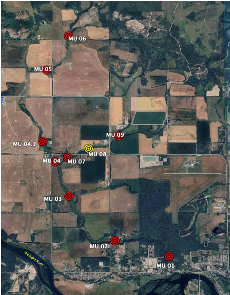
Figure 1. Locations of sampling sites on Murray Creek in relation to NEWSS restoration sites